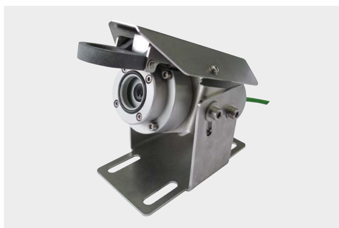
BARTEC Camera Ex